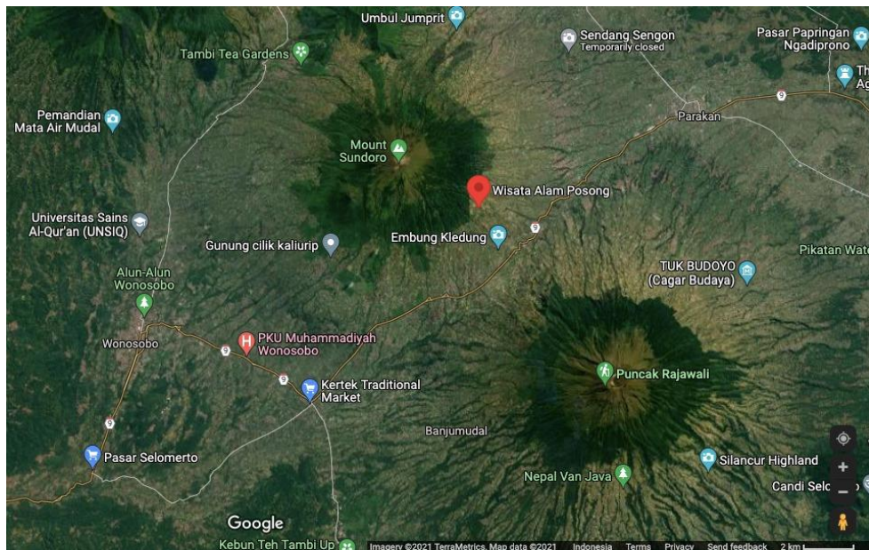
Figure 2. Posong natural tourism