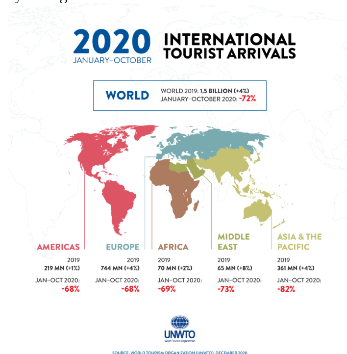
Figure 1. UNWTO Data on International Tourist Arrivals for the January-October 2020 Period

According to the World Tourism Organization (UNWTO) on its official website, the travel and tourism industry is one of the sectors most affected by the spread of the Covid-19 pandemic. Data compiled by UNWTO shows that in the period January to October 2020 international tourist arrivals worldwide decreased by 72% or 900 million less than the same period in the previous year and resulted in a loss of export revenue from tourism of USD 935 billion or around 13 trillion Rupiah. The decline is equivalent to the normal situation of the tourism industry 30 years ago.