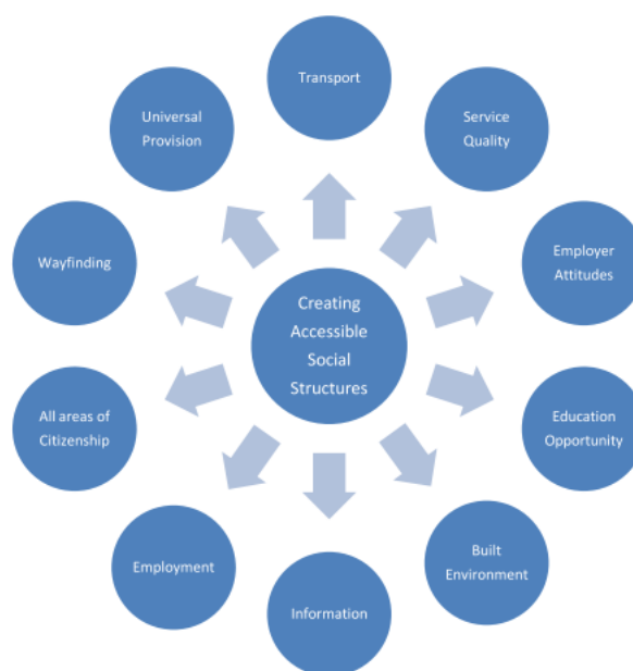
Figure 3: Social model of people with disabilities

Source: Simon Darcy and Dimitrias Buhalis "Conceptualising Disability"(Darcy & Buhalis, 2020)